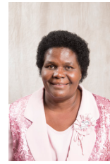
Kaishungu-Shinana, Lonja Ohangwena