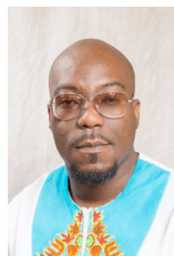
Booy, Steve Biko Otjozondjupa