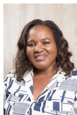
Ndjago, Melania Erongo