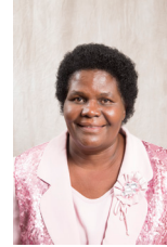
Kaishungu-Shinana, Lonia Ohangwena