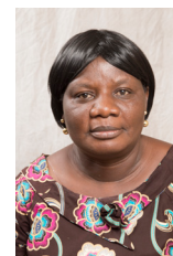
Kauma, Victoria Mbawo Kavango East