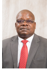
Mupya, Weich Murcle Uapendura Kunene