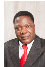
Kuushomwa, Lotto Oshana